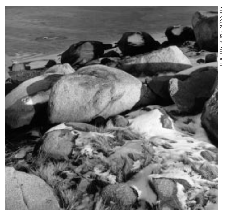
Strong community support in Gloucester enabled the Essex Country Greenbelt Association to purchase Goose Cove Reservation.

For information about the Forest Legacy Program.