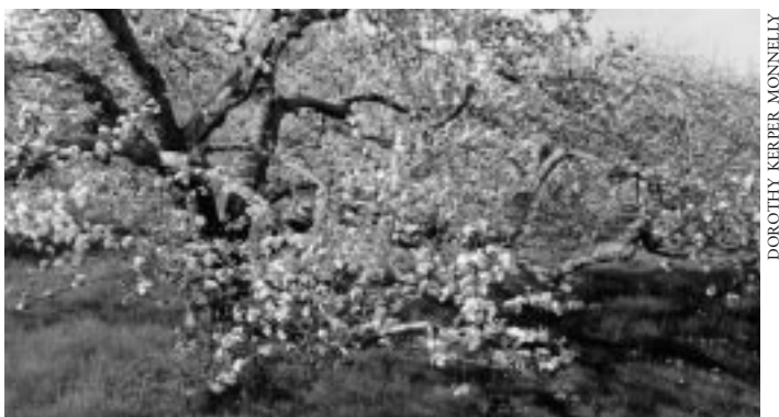
Russell Orchards in Ipswich is enrolled in Chapter 61A and is further preserved by an agricultural preservation restriction held by Essex County Greenbelt Association.

Interest in this program on the part of ordinary owners of natural areas and recreational land appears to be growing. For one thing, owners need not actually do anything with the land. Under Chapter 61 the owner must develop a forest management plan and actually harvest timber from time to time. Under Chapter 61A the owner must engage in an active agricultural program. Owners have also come to realize that many properties will qualify rather easily as "open space" under Chapter 61B, which will mean that no public access is required.