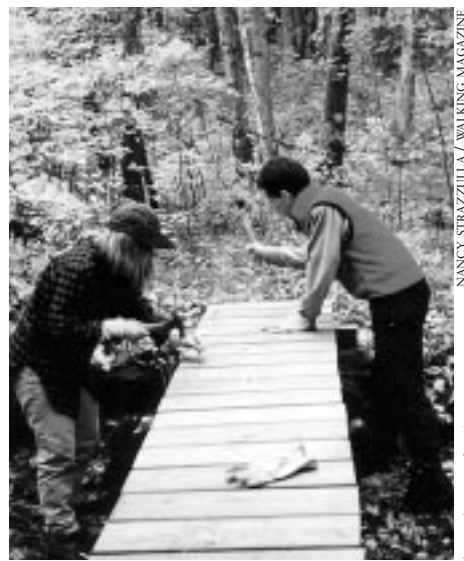
Volunteers from Walking Magazine building a stream crossing in Harold Parker State Forest in Andover, part of the Bay Circuit Trail.

A management agreement enables a land trust or open space agency to help plan for the care of the natural and scenic features of your land. Management agreements are written for a defined term, usually a short term. They are renewable and they usually provide for revocation by either party with appropriate notice. They are often used to protect plant and wildlife habitats or to keep scenic fields open. The land trust often provides technical advice and assistance (sometimes for a fee), while the landowner carries out the plan. In most cases, only nominal lease payments are involved.