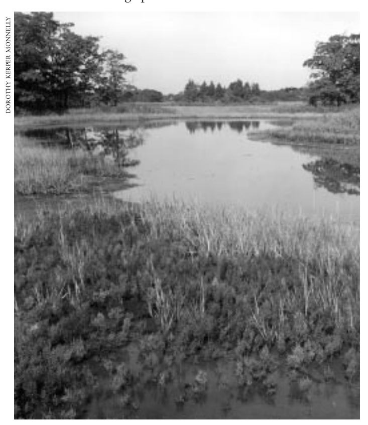
Salt panne at Sawyer's Island Conservation Area in Rowley is subject to a conservation restriction held by the Essex County Greenbelt Association.

An example will illustrate this concept. Assume that Mr. Brown owns two adjacent lots, one with river frontage, and the other overlooking the first. Assume that the fair market value of each lot is $100,000. A conservation restriction is placed on the first lot, reducing its value to $20,000, because a house is no longer permitted on it. As required by the IRS, the appraiser turns his attention to the adjacent, retained lot, and determines that its value has been increased to $125,000, because it now overlooks protected land rather than land that might be developed in the future. The net change in value after the restriction is calculated as $80,000 (the reduction in value of the first lot) minus $25,000 (the increase in value of the other lot), for a net tax-deductible donation of $55,000. Usually, this so-called enhancement value will be less than indicated in this example. Often, 10% is used as a rule-ofthumb for planning purposes, but an appraiser must arrive at an estimate using specific market research.