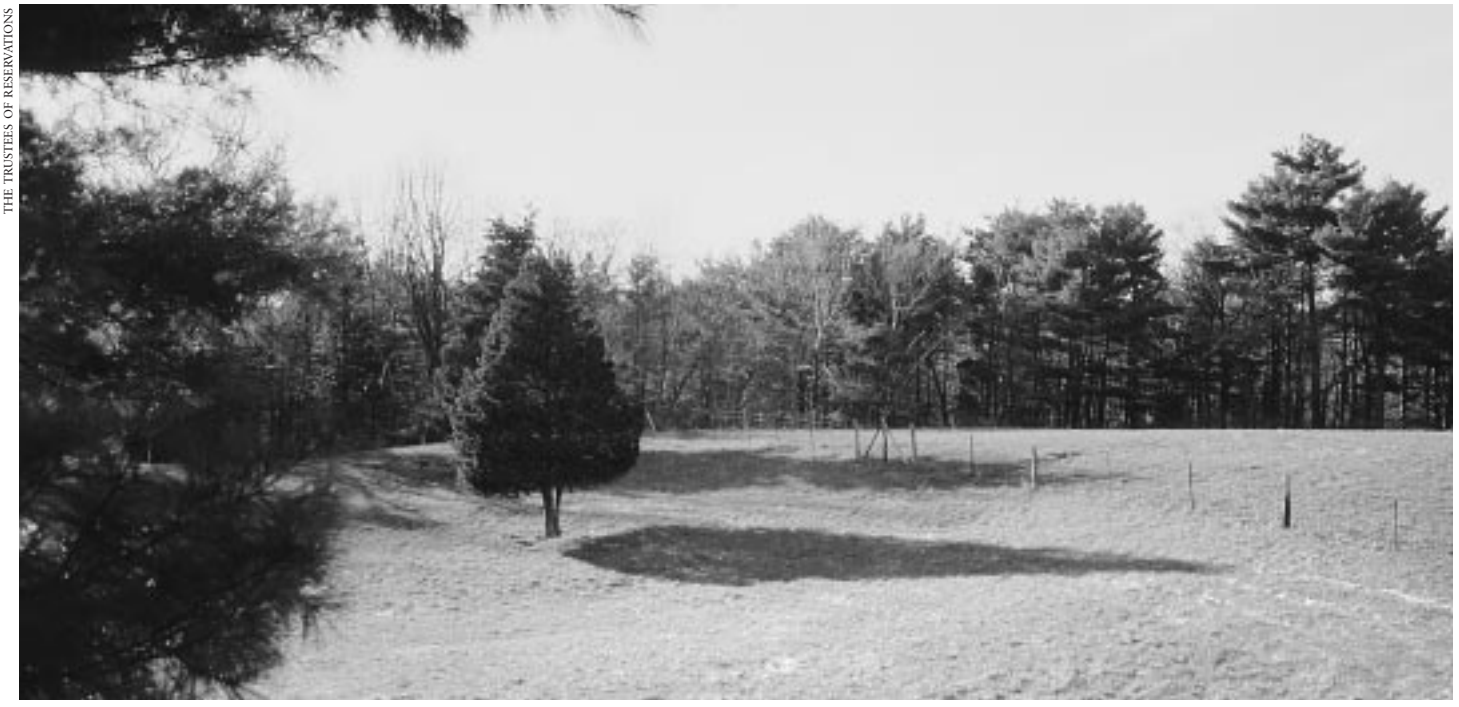
Development on the properties surrounding Powisset Farm in Dover is limited by deed restrictions held by The Trustees of Reservations.