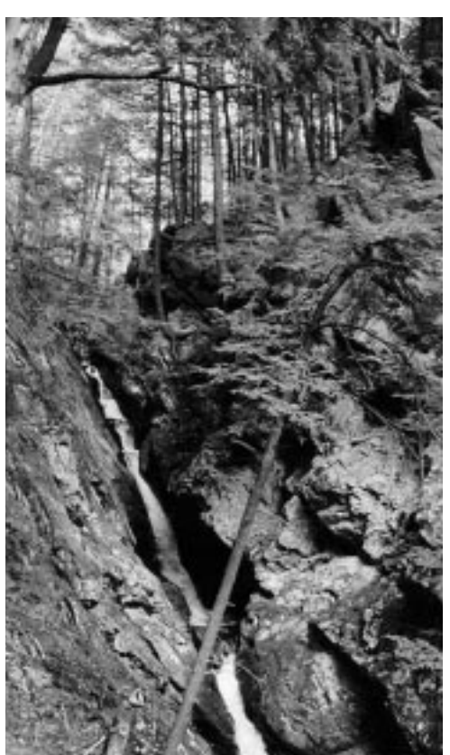
Stevens Glen, Richmond. The donors of this 128-acre parcel located on the side of West Stockbridge Mountain opted for a two-fold protection plan, imposing a conservation restriction co-held by the Richmond Land Trust and the Berkshire Natural Resources Council before conveying title to the BNRC.