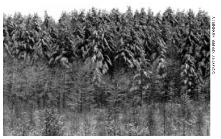
Schenob Brook Fen Preserve in Sheffield, owned by The Nature Conservancy, is one part of a larger complex of protected lands.

Watershed preservation restrictions: A special type of conservation restriction recognized by Massachusetts law that gives the holder the right to retain land in such condition so as to protect the water supply or potential water supply of the Commonwealth by prohibiting building construction and placement and surface alterations such as mining or excavation of materials.