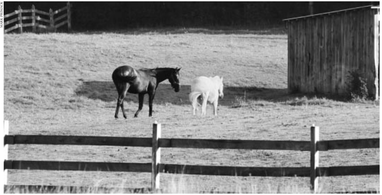
Grazing Fields Farm in Bournedale is enrolled in Chapter 61A and additionally protected by an agricultural preservation restriction held by the Wildlands Trust of Southeastern Massachusetts.