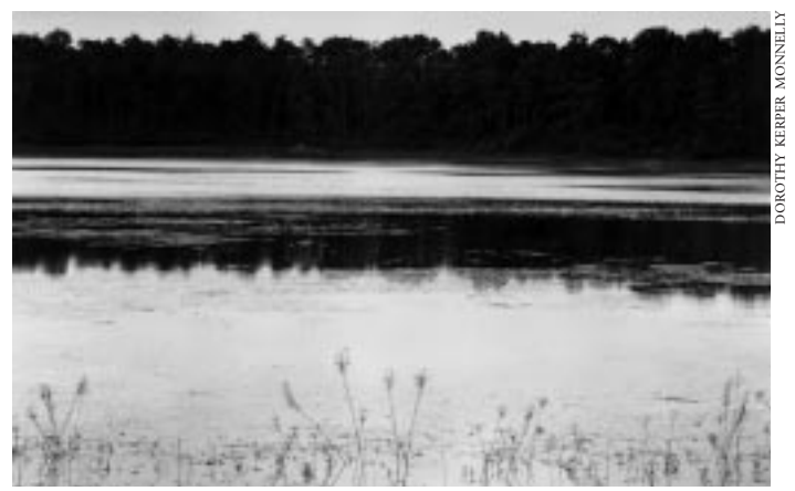
A cooperative agreement between The Nature Conservancy and the Barnstable Water Company, owners of Mary Dunn Pond in Hyannis allows TNC to research the effect of groundwater withdrawals and hydrological changes on plants of coastal plain ponds.

Even when their holders remember to re-record them, private deed restrictions are inherently less stable and permanent than conservation restrictions. Courts may refuse to enforce private deed restrictions if they are contrary to public policy or if conditions have changed substantially since they were created. There are no income