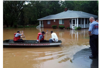
Flooding in Charlotte, NC after heavy rain in 2011.

“Since 1999, Storm Water Services has purchased over 400 flood-prone houses, apartment buildings and businesses that were in floodplains throughout Charlotte-Mecklenburg. Over 700 families and businesses have moved to less vulnerable locations