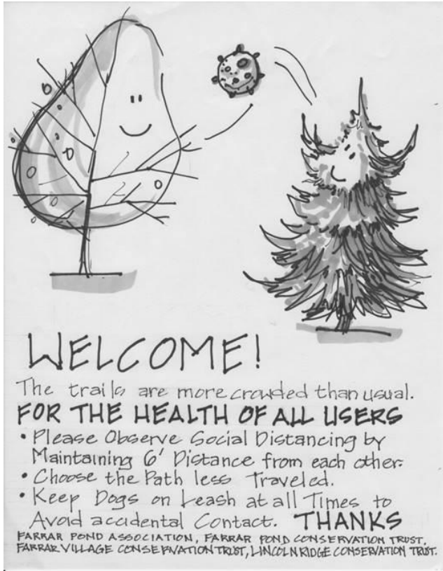
from Farrar Pond Conservation Trust