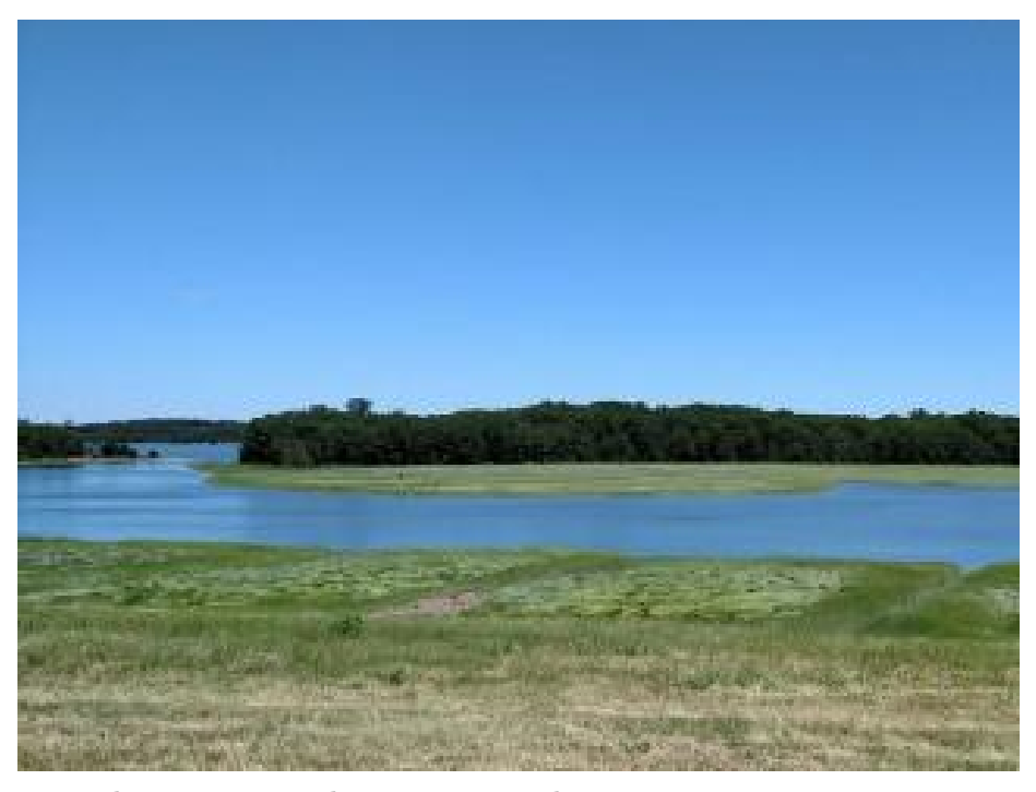
Back River Trail, Weymouth