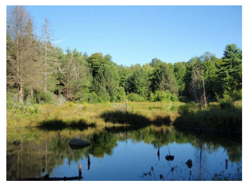
Leyden Working Farms and Forest, Franklin Land Trust