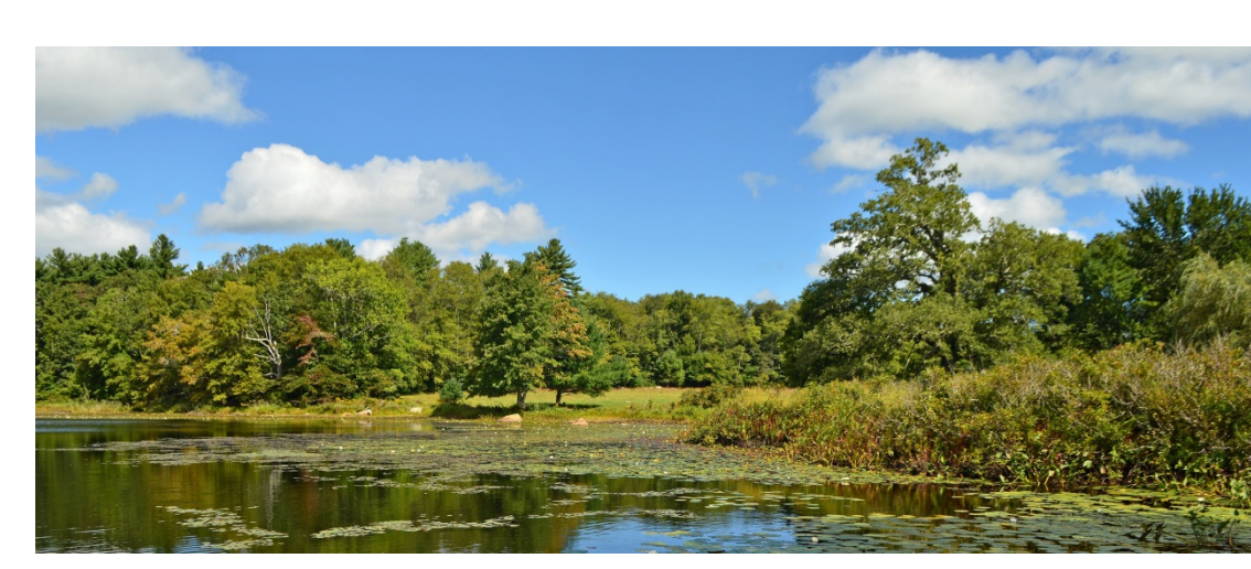
Mattapoisett River Aquifer Protection project