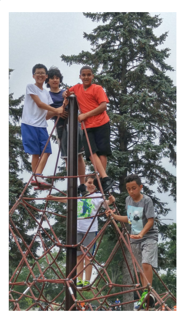
Hazelwood Park, New Bedford