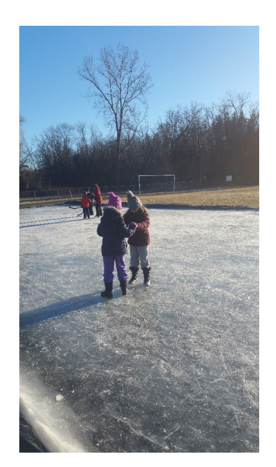
Lee Athletic Field