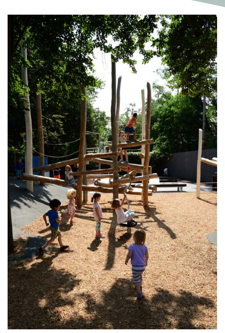
Hoyt-Sullivan Park, Somerville