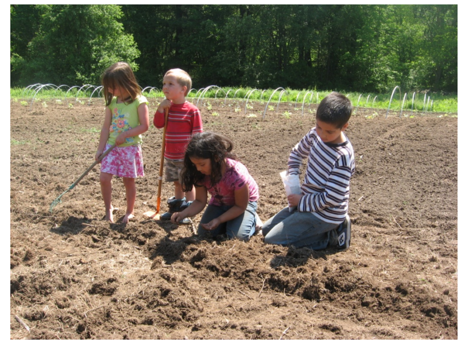
Frohloff Farm, Ware