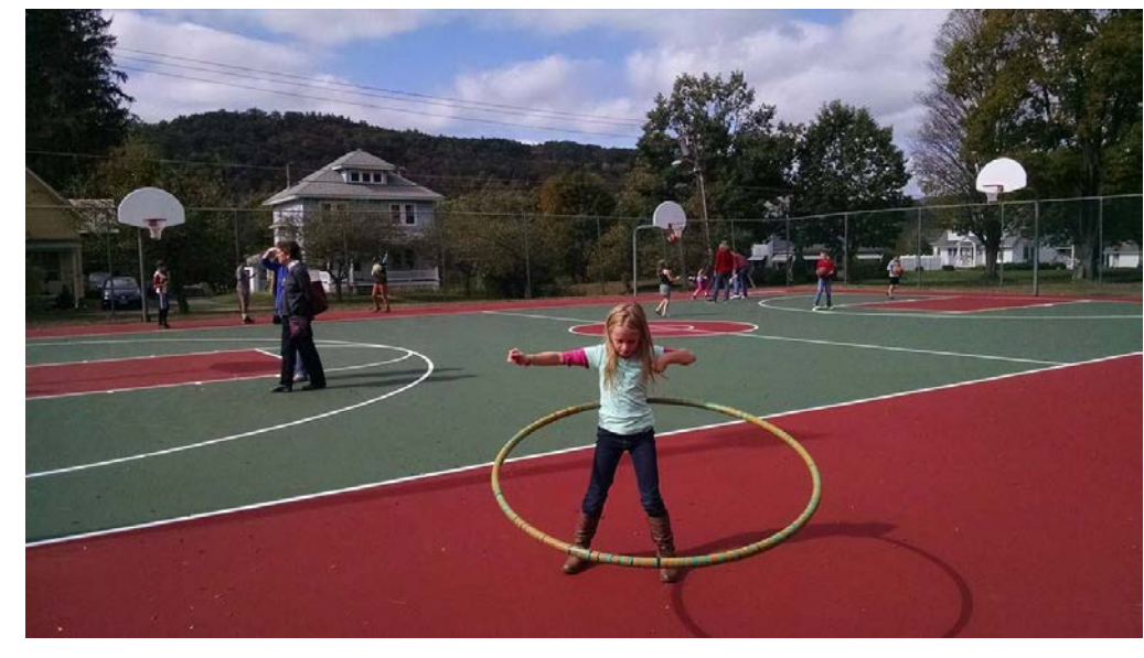
Tennis Courts, Shelburne