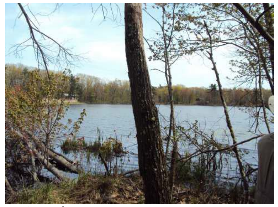
Muir Meadows, Worcester DPW