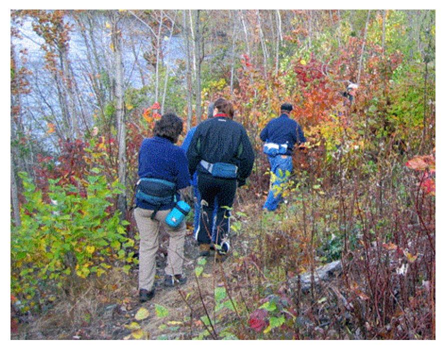
Andover Village Improvement Society, Franciscan Acquisition