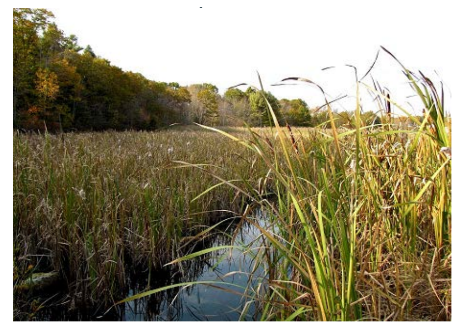
Sibley Farm, Spencer Mass Audubon, Common Ground Land Trust, and the Greater Worcester Land Trust