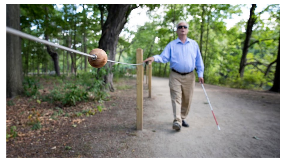
Watertown Riverfront Park Braille Trail