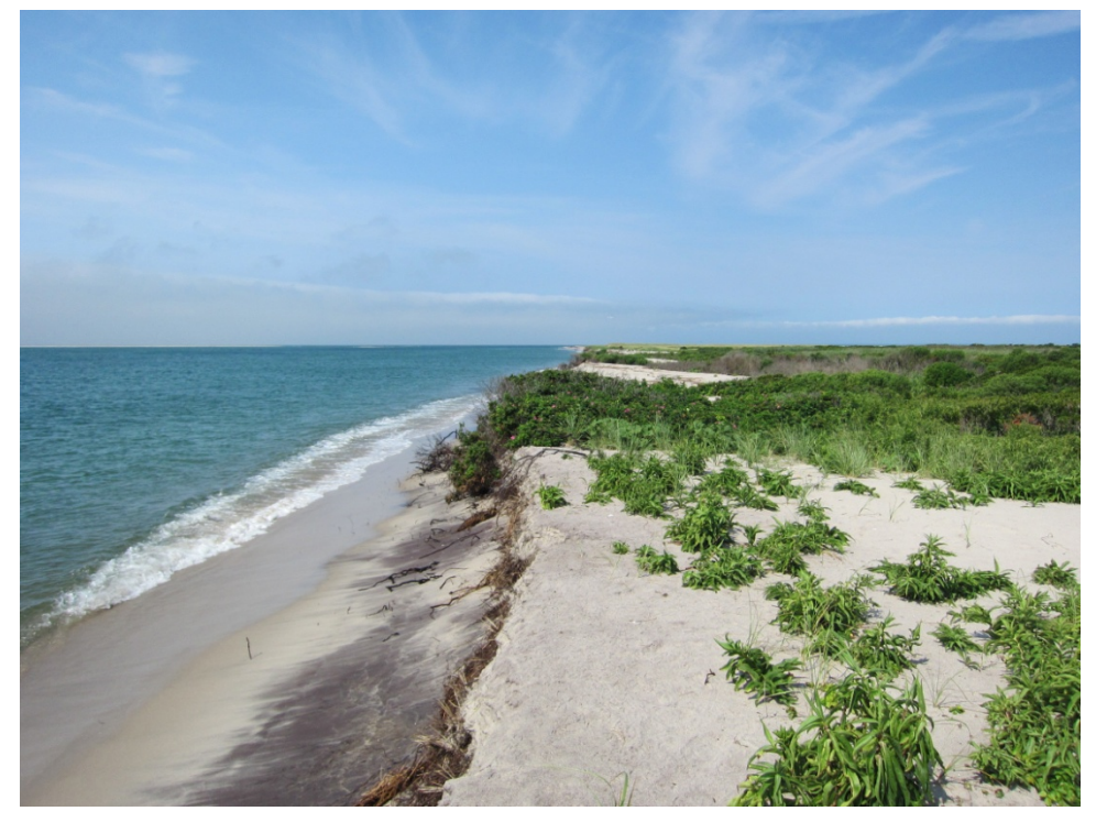
Muskeget Island, Nantucket Land Council