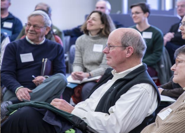
Mass. Land Conservation Conference, 2019