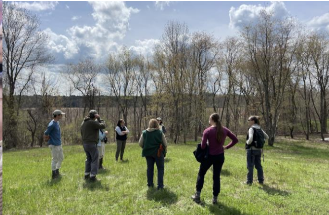
Smith Conservation Land, Sudbury Valley Trustees