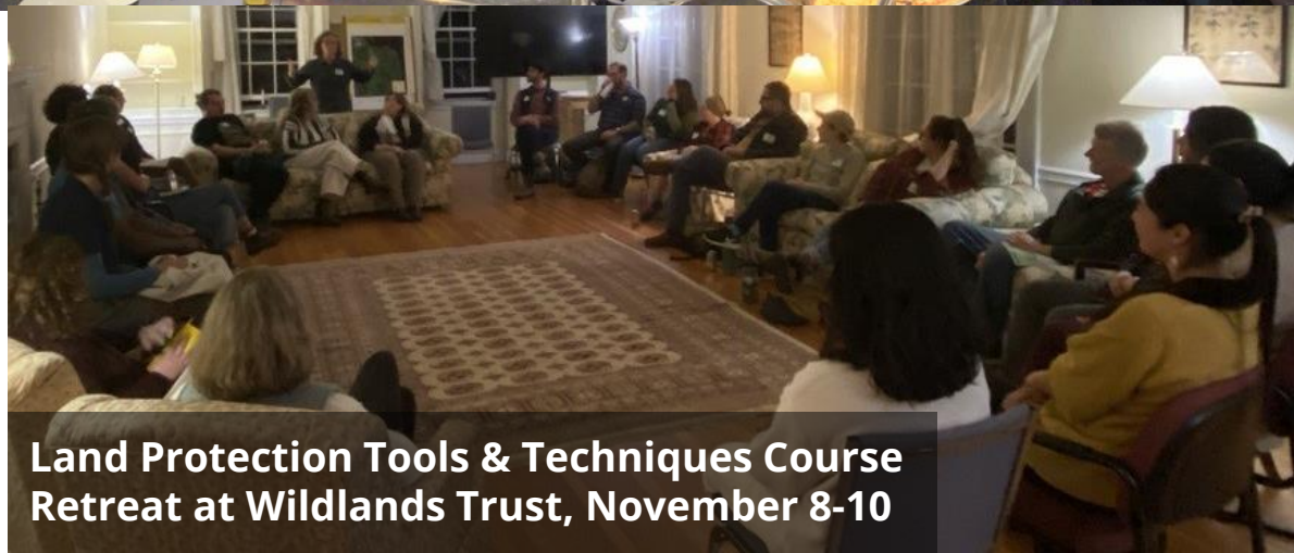
Land Protection Tools & Techniques Course Retreat at Wildlands Trust, November 8-10