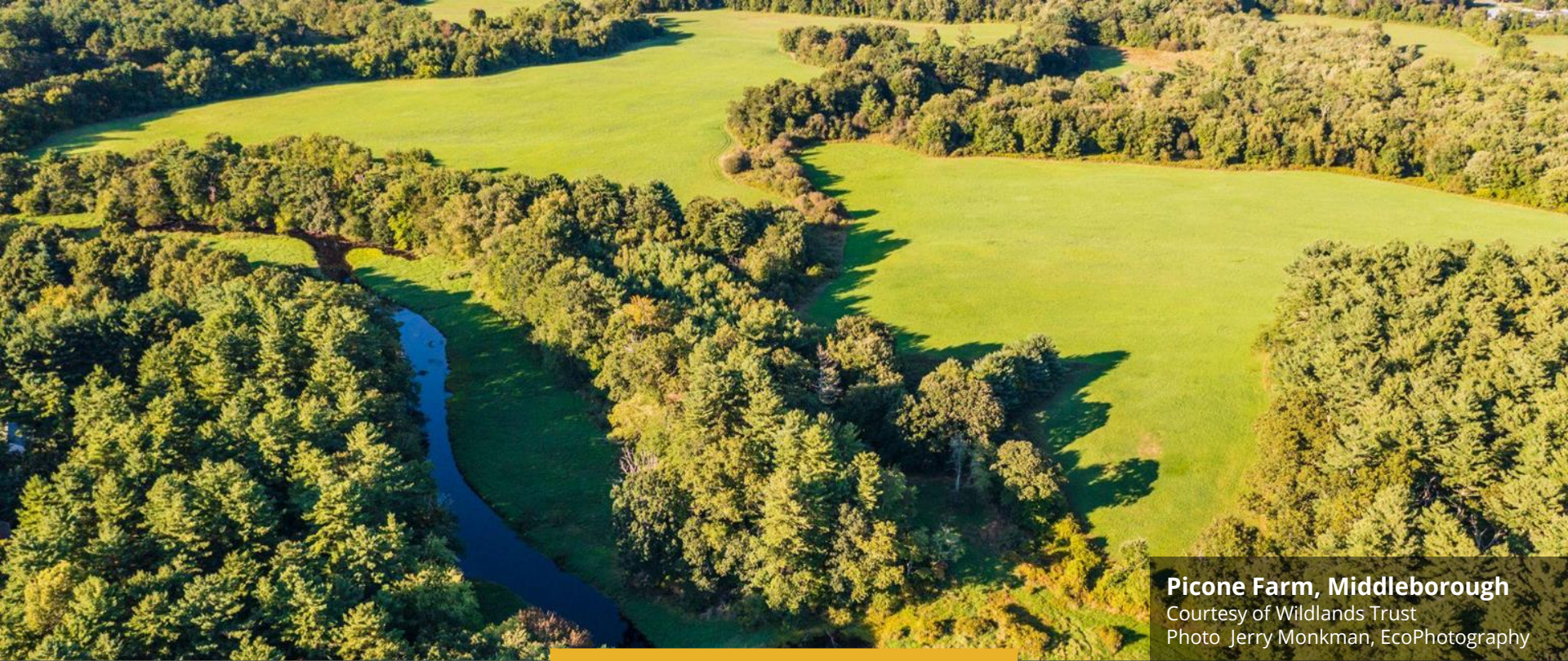
Picone Farm, Middleborough