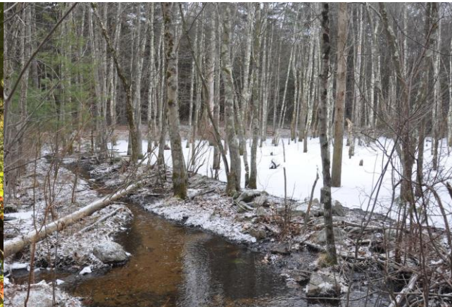
The Dunn Land, Acton Conservation Trust