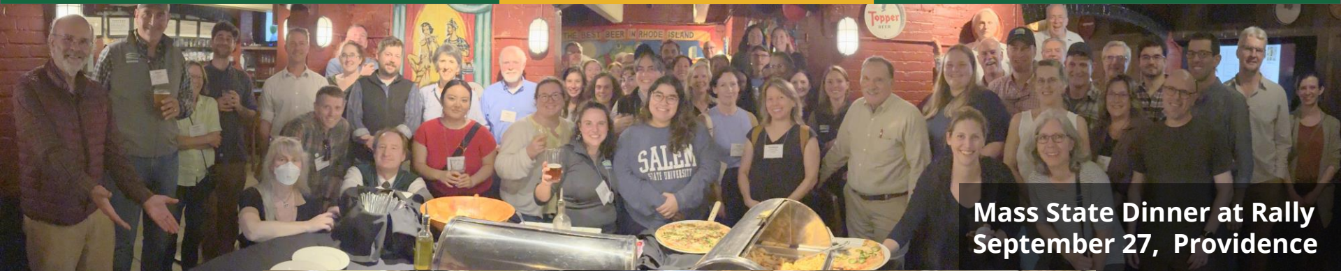
Mass State Dinner at Rally September 27, Providence