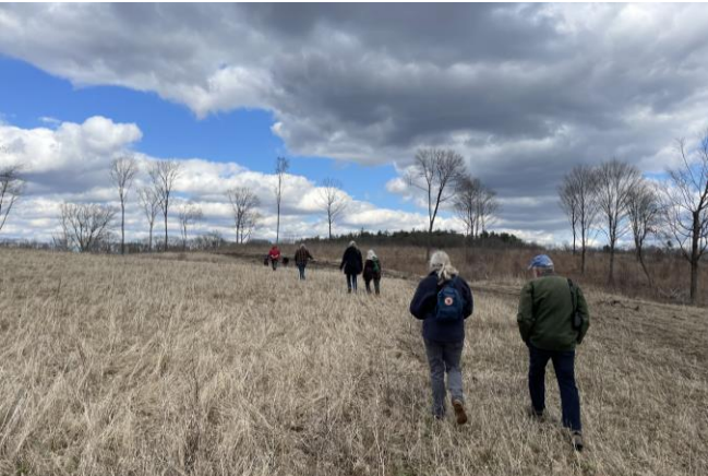
Elm Hill Wildlife Sanctuary, Mass Audubon