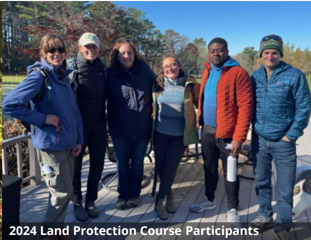
2024 Land Protection Course Participants