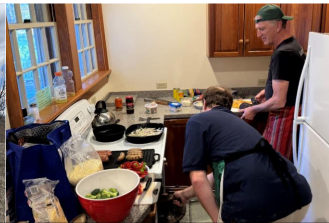
Pizza Chefs, 2024 Retreat