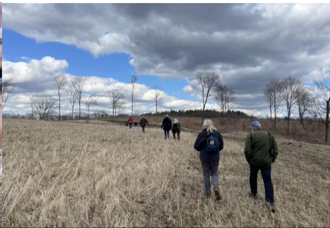
Elm Hill Wildlife Sanctuary, Mass Audubon