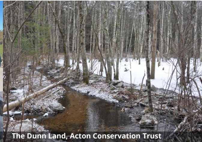
The Dunn Land, Acton Conservation Trust