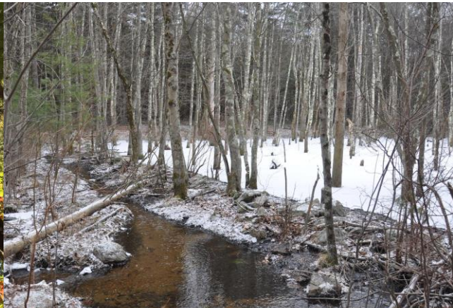
The Dunn Land, Acton Conservation Trust