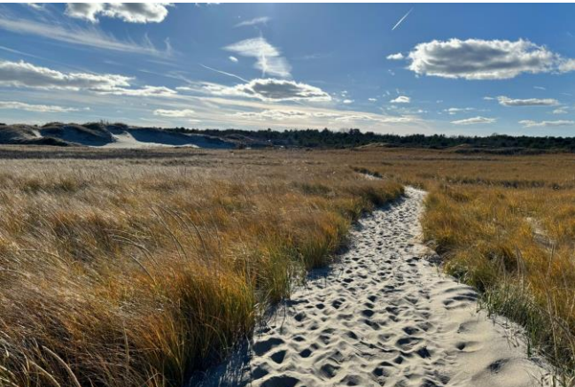
Crane Beach, Ipswich, The Trustees

Rita Gibes Grossman (2011 – 2025) Kristen Sykes (2019 – 2025)