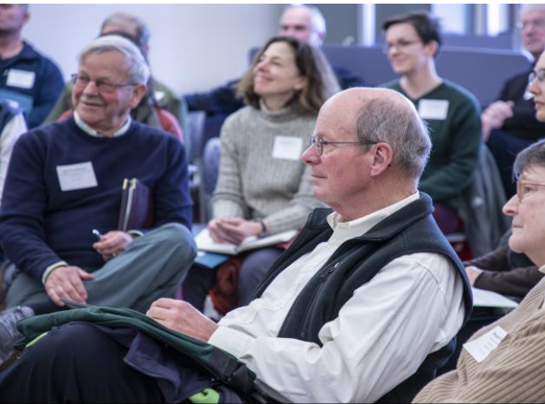
Mass. Land Conservation Conference, 2019