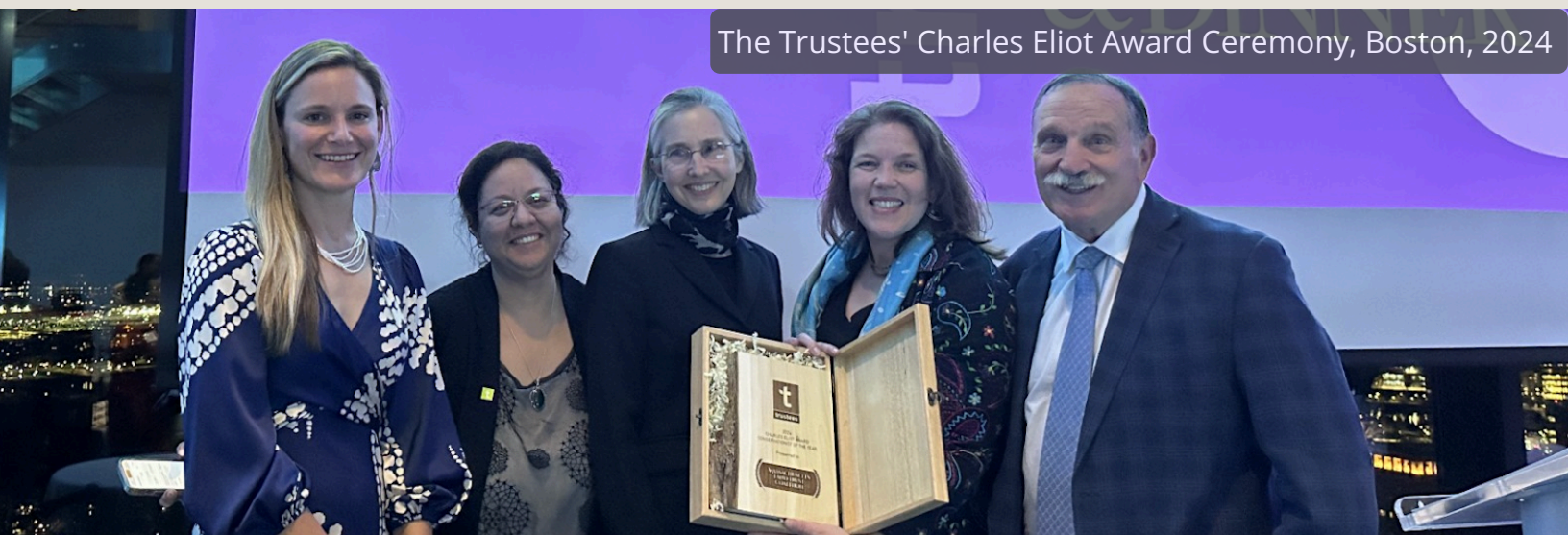
The Trustees' Charles Eliot Award Ceremony, Boston, 2024

MLTC has built a statewide network of talented public and private partners working to protect our natural resources. Our community is empowered by, and relies upon, the unity, structure, and camaraderie MLTC has established across the land protection field.