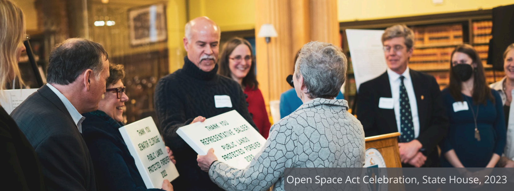
Open Space Act Celebration, State House, 2023