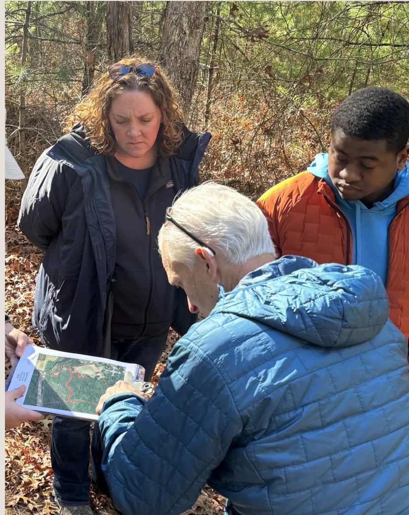
Land Protection Course, Plymouth, 2024

Preferred start date is mid-June 2026. Applications are requested by February 4, 2026. To apply, submit resume and cover letter, in a single PDF, via email to EDsearch@massland.org , with subject line "Executive Director: [your last name]".