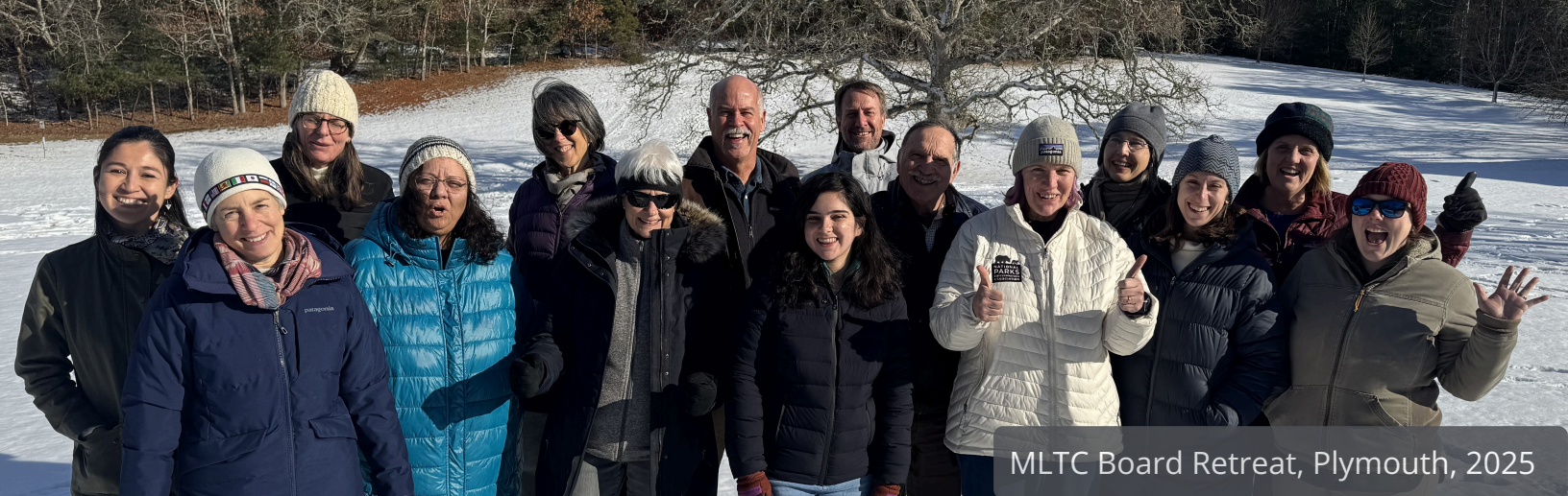
MLTC Board Retreat, Plymouth, 2025