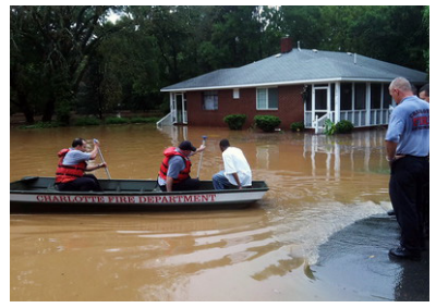
Flooding in Charlotte, NC after heavy rain in 2011.

"In May 2013, Governor Christie designated the Blue Acres program, which is part of New Jersey's Department of Environmental Protection, to operate the state's entire post-Sandy acquisition effort. The Governor's goal was, and remains,