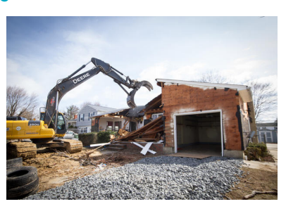
The first house to be demolished as part of the Blue Acres buyout program, in Sayreville, NJ in March 2014.

"Since 1999, Storm Water Services has purchased over 400 flood-prone houses, apartment buildings and businesses that were in floodplains throughout Charlotte-Mecklenburg. Over 700 families and businesses have moved to less yulnerable