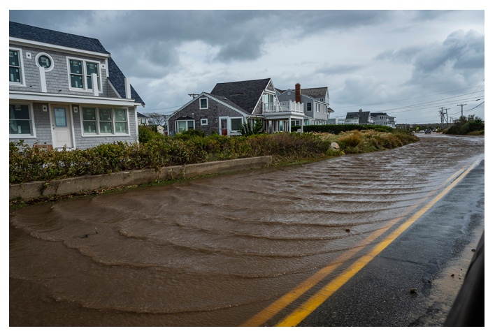
Winter storm Riley - Lynn, MA.

Outlines eligible projects including property that is a flood risk (as defined), property used for residential, nonprofit, or small business purposes, and projects that also receive funding from the federal emergency management agency.