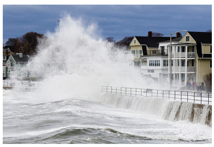
Winter storm Riley - Lynn, MA.

of increasing flood risk, or who cannot afford to continuously rebuild after extreme weather hits.