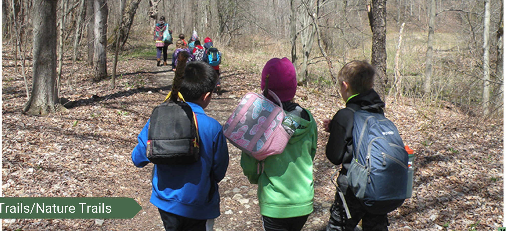
Hiking Trails/Nature Trails