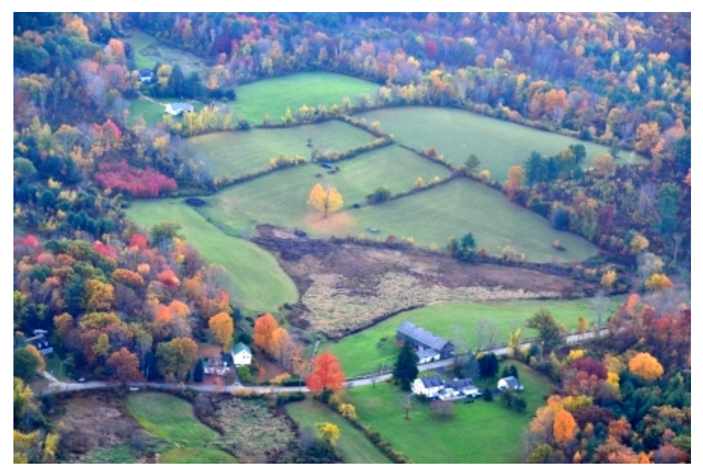
Wendemuth Meadow, North Brookfield

Purchase land for conservation and passive recreation in fee simple or a Conservation Restriction (CR)