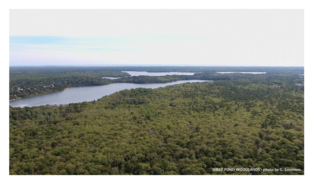
Gulls Way Forest, Brewster Conservation Trust