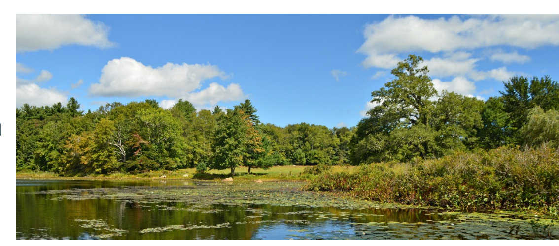
Mattapoisett River Aquifer Protection project