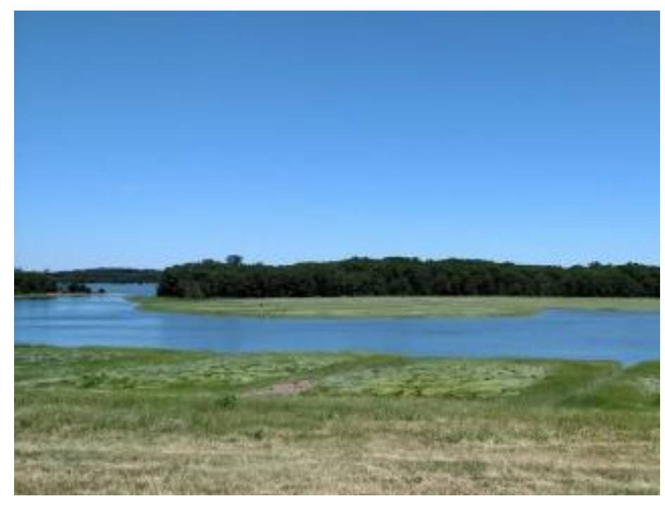
Back River Trail, Weymouth