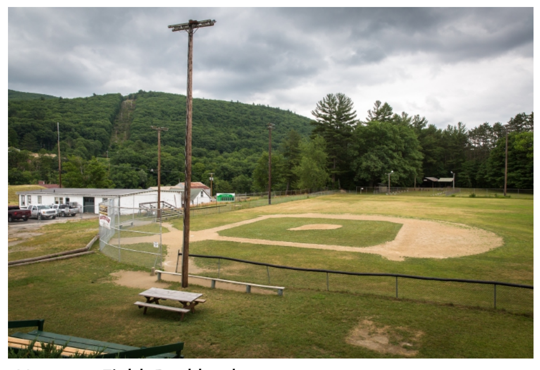
Veterans Field, Buckland