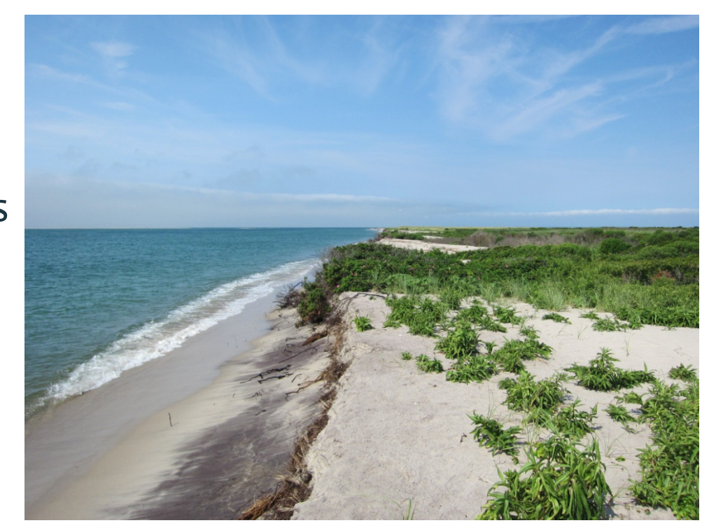
Muskeget Island, Nantucket Land Council