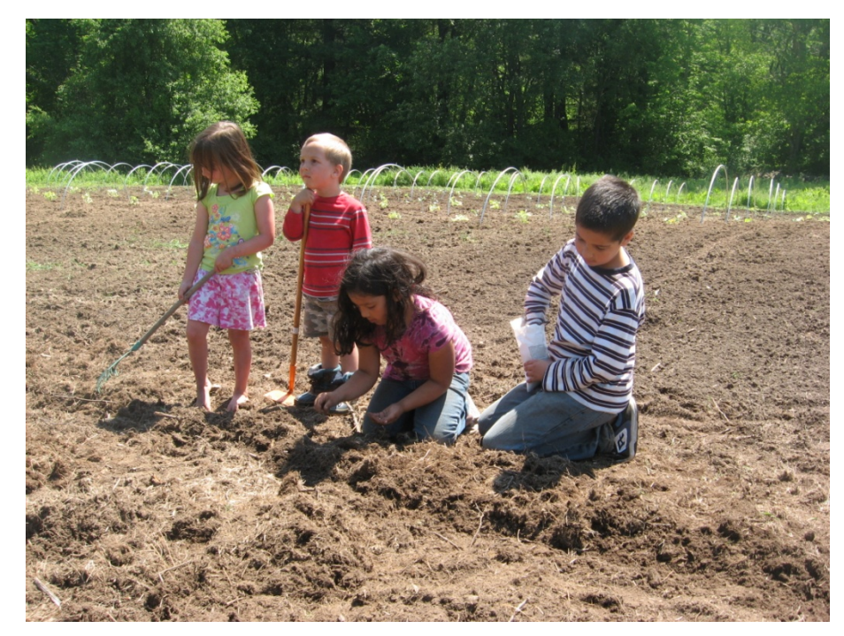
Frohloff Farm, Ware