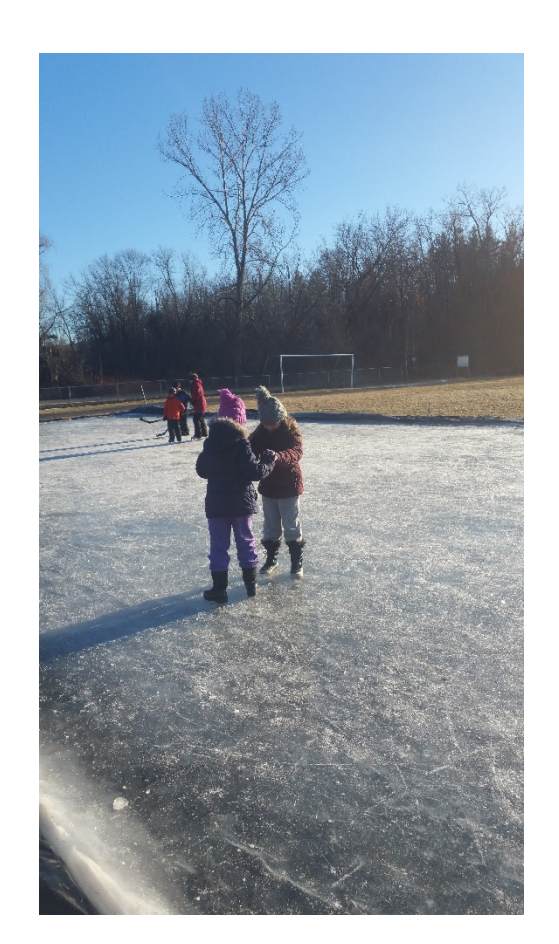
Lee Athletic Field