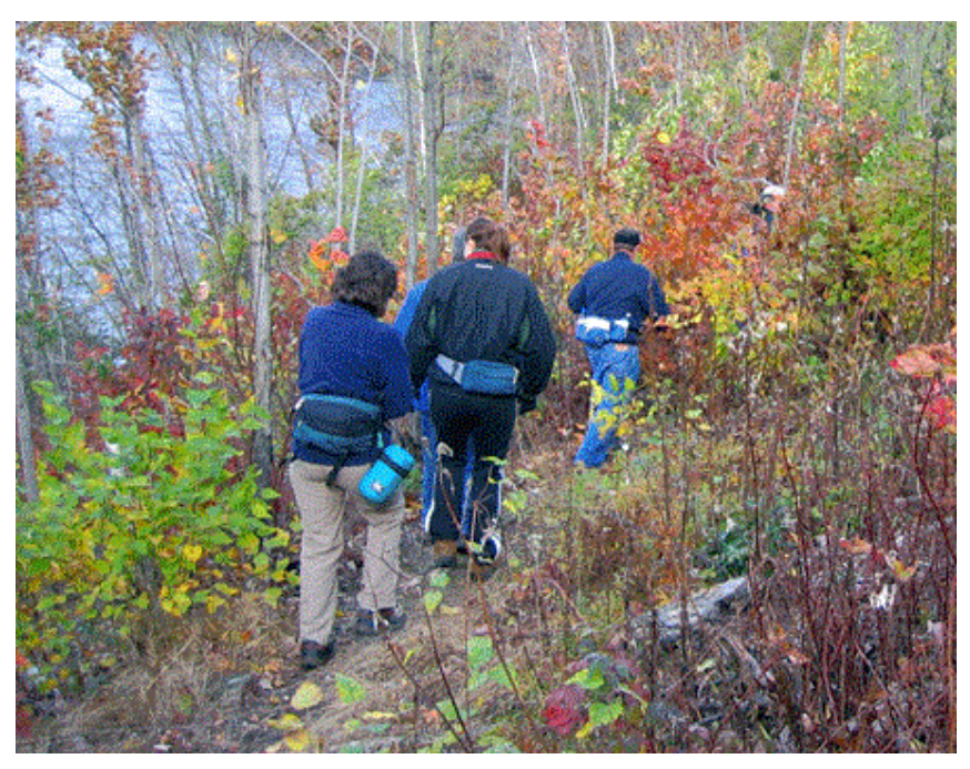
Andover Village Improvement Society, Franciscan Acquisition