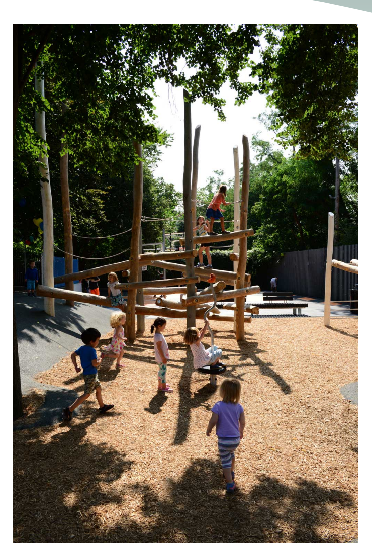
Hoyt-Sullivan Park, Somerville