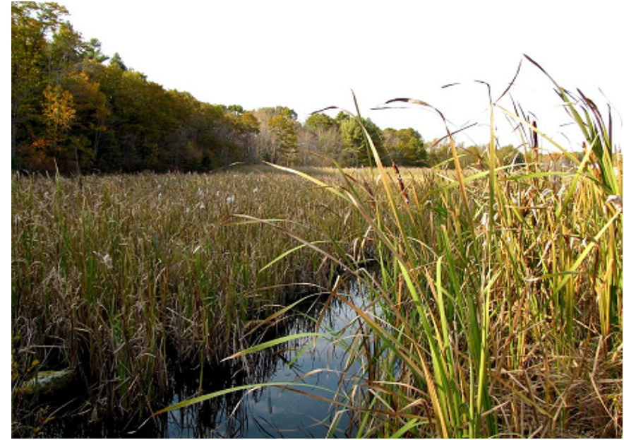
Sibley Farm, Spencer Mass Audubon, Common Ground Land Trust, and the Greater Worcester Land Trust