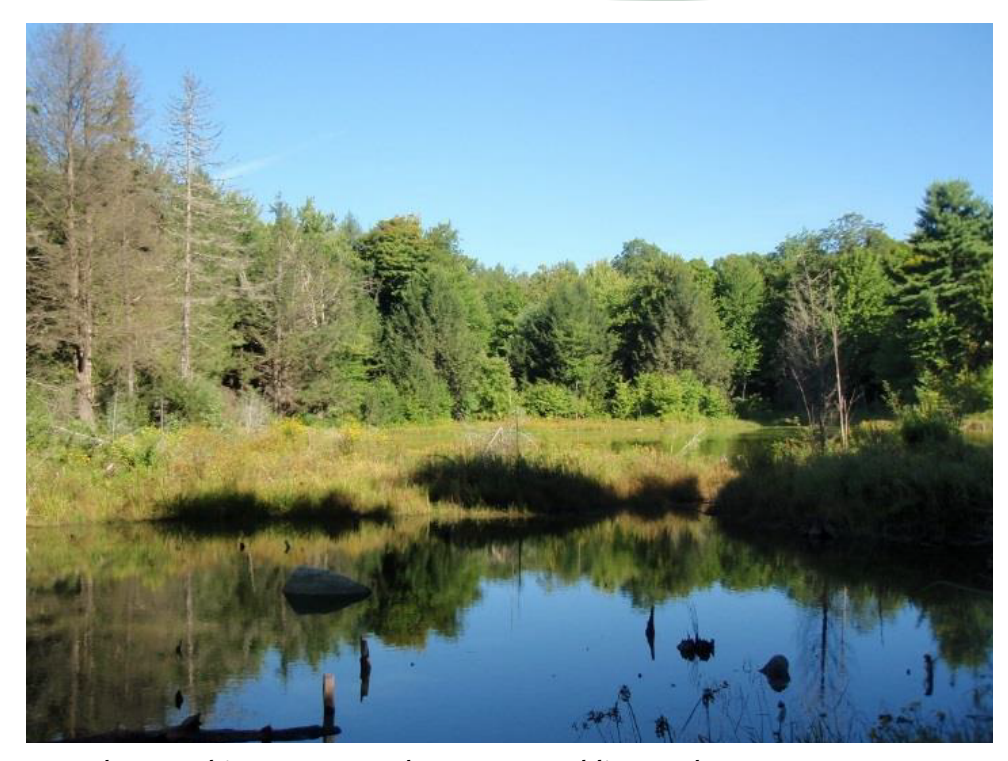
Leyden Working Farms and Forest, Franklin Land Trust