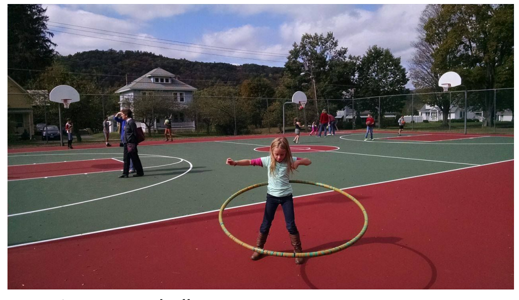
Tennis Courts, Shelburne