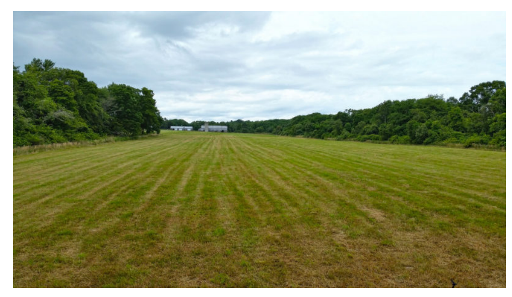
Shaw Cove Fields and Marshes Conservation Project, Buzzards Bay Coalition