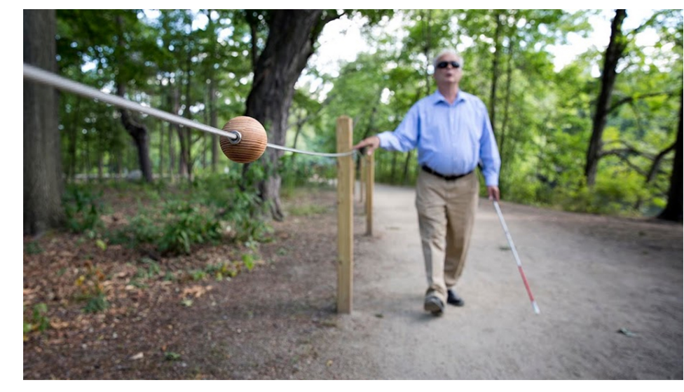
Watertown Riverfront Park Braille Trail