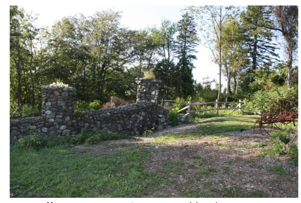
Mt. Jefferson Conservation Area, Hubbardston