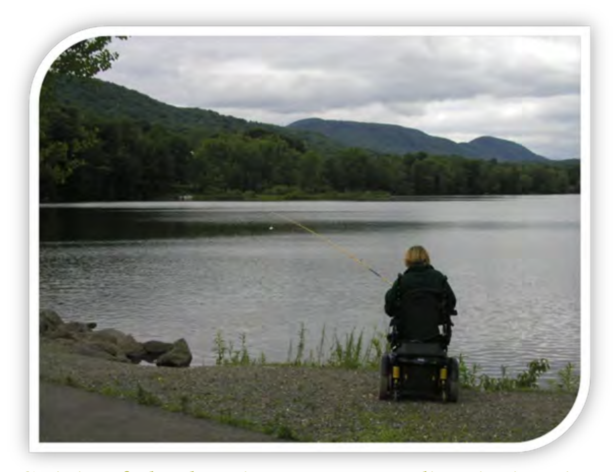
Spirit of the law is to prevent discrimination