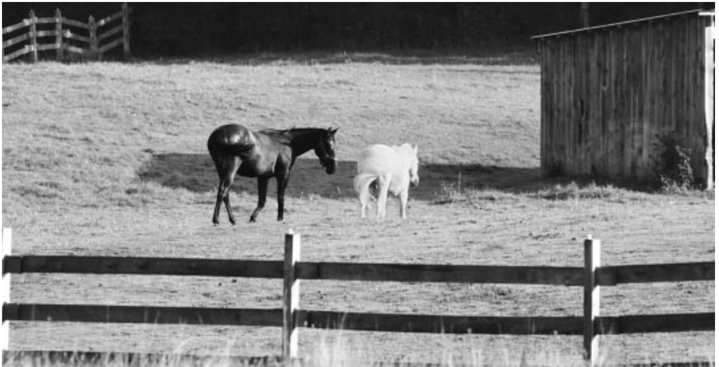
Grazing Fields Farm in Bourne is enrolled in Chapter 61A and additionally protected by an agricultural preservation restriction held by the Wildlands Trust of Southeastern Massachusetts.