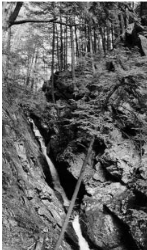
Stevens Glen, Richmond. The donors of this 128-acre parcel located on the side of West Stockbridge Mountain opted for a two-fold protection plan, imposing a conservation restriction co-held by the Richmond Land Trust and the Berkshire Natural Resources Council before conveying title to the BNRC.