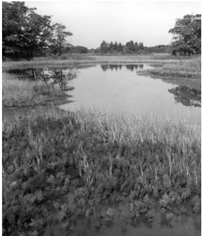
Salt panne at Sawyer's Island Conservation Area in Rowley is subject to a conservation restriction held by the Essex County Greenbelt Association.