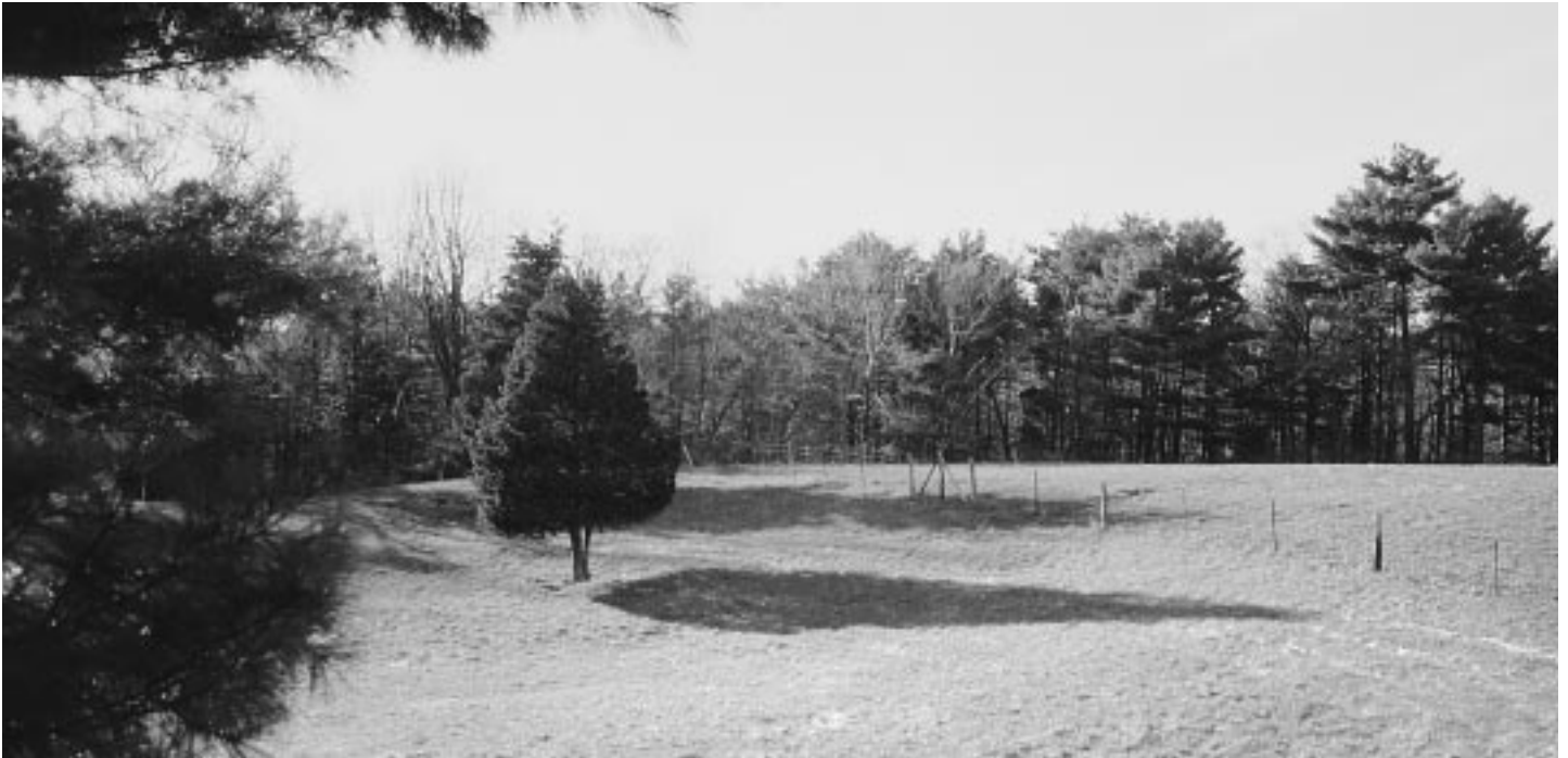
Development on the properties surrounding Powisset Farm in Dover is limited by deed restrictions held by The Trustees of Reservations.