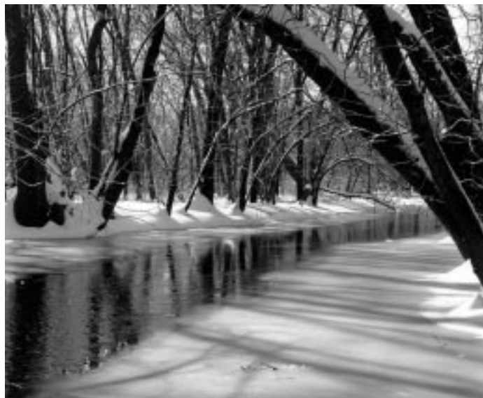
Killam Island, donated in fee to the Essex County Greenbelt Association, is one component of a larger protected area preserving the shore of the Ipswich River.

For most people, attending to their estate plans is, at best, a chore, quickly put aside when the immediate task has been completed and the documents have been signed. The increase in the federal estate tax exemption beyond $675,000 may lead many people into a false sense of security. In localities where lots are selling for $175,000 and up, a relatively small amount of land can easily exceed the value of the unified tax credit. Moreover, tax rules as well as personal circumstances change. For these reasons, it is important to keep estate plans up to date. Careful review of an estate plan may reveal an opportunity to make a gift of land or conservation restriction as described in this booklet.