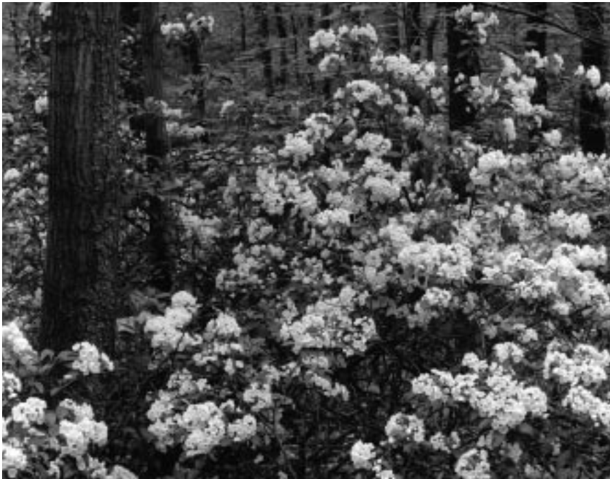
DOROTHY KERPER MONNELLY

The disadvantages are obvious: you will no longer own, hold, and control the property, therefore you may not pass it on to your children or heirs. The gift will be permanent and irrevocable.