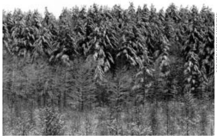
Schenob Brook Fen Preserve in Sheffield, owned by The Nature Conservancy, is one part of a larger complex of protected lands.

Watershed preservation restrictions: A special type of conservation restriction recognized by Massachusetts law that gives the holder the right to retain land in such condition so as to protect the water supply or potential water supply of the Commonwealth by prohibiting building construction and placement and surface alterations such as mining or excavation of materials.