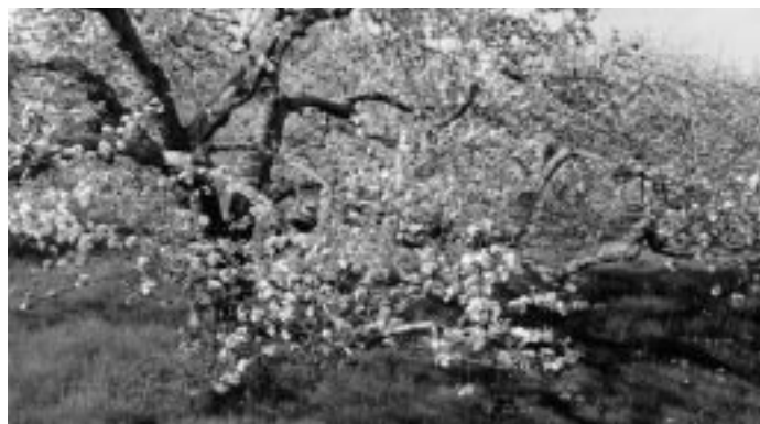
Russell Orchards in Ipswich is enrolled in Chapter 61A and is further preserved by an agricultural preservation restriction held by Essex County Greenbelt Association.

Interest in this program on the part of ordinary owners of natural areas and recreational land appears to be growing. For one thing, owners need not actually do anything with the land. Under Chapter 61 the owner must develop a forest management plan and actually harvest timber from time to time. Under Chapter 61A the owner must engage in an active agricultural program. Owners have also come to realize that many properties will qualify rather easily as "open space" under Chapter 61B, which will mean that no public access is required.