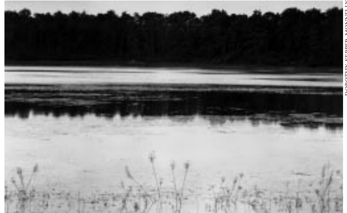
DOROTHY KERPER MONNELLY

Even when their holders remember to re-record them, private deed restrictions are inherently less stable and permanent than conservation restrictions. Courts may refuse to enforce private deed restrictions if they are contrary to public policy or if conditions have changed substantially since they were created. There are no income