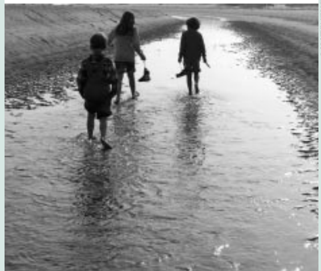
DOROTHY KERPER MONNELLY

We hope that you are, or will become, committed to conserving your land to the extent feasible for you and your family. If so, begin the process today! Do not let inaction or procrastination jeopardize the future of the land you treasure. A small investment of time, attention, and creativity now will launch a process that could be of immense benefit to you, your children, your neighbors, and your community.