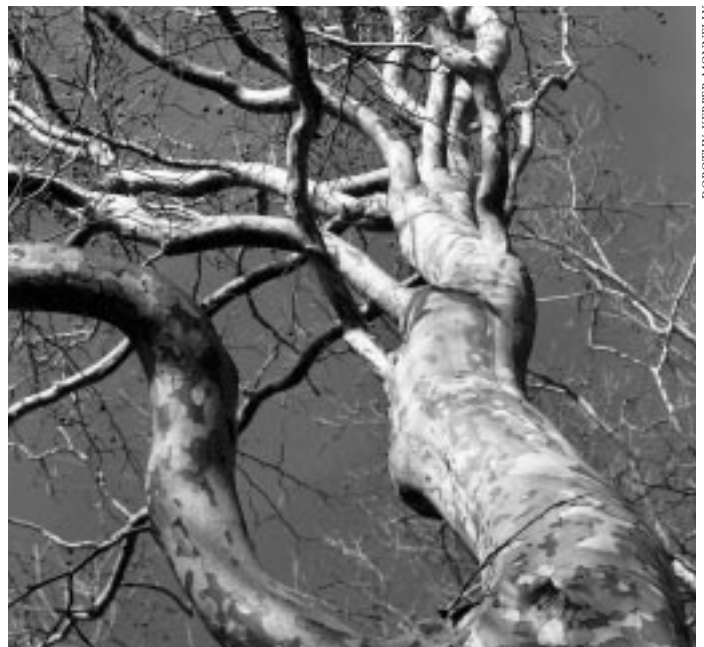
DOROTHY KERPER MONNELLY

Often such owners subsequently decide to impose permanent conservation restrictions to ensure permanent protection. Having done so, they should not forget to maintain their 61, 61A, or 61B status. In the case of Chapter 61A (agricultural) and 61B (recreational), for instance, that means submitting the annual application by October 1. If this is not done, the landowner may find that taxes on the parcel increase substantially (even though it is under a conservation restriction) until the classification can be restored.