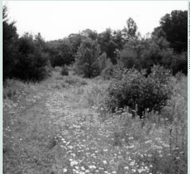
MASSACHUSETTS AUDUBON SOCIETY