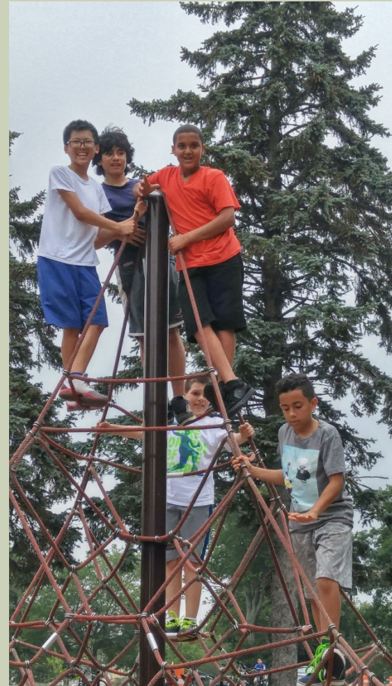
Hazelwood Park, New Bedford