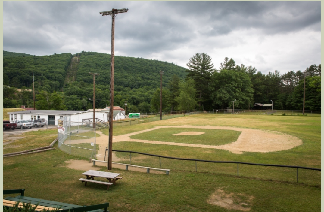
Veterans Field, Buckland