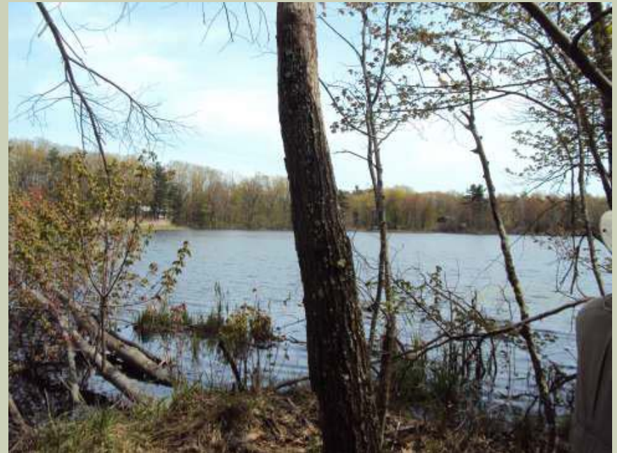
Muir Meadows, Worcester DPW