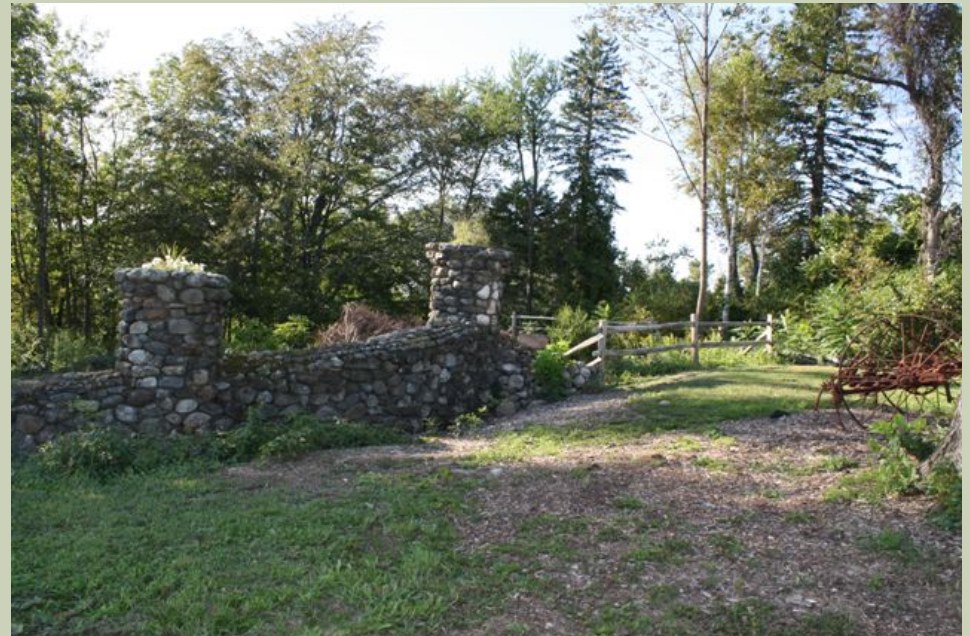
Mt. Jefferson Conservation Area, Hubbardston