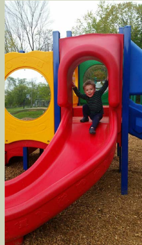
Lee Athletic Field