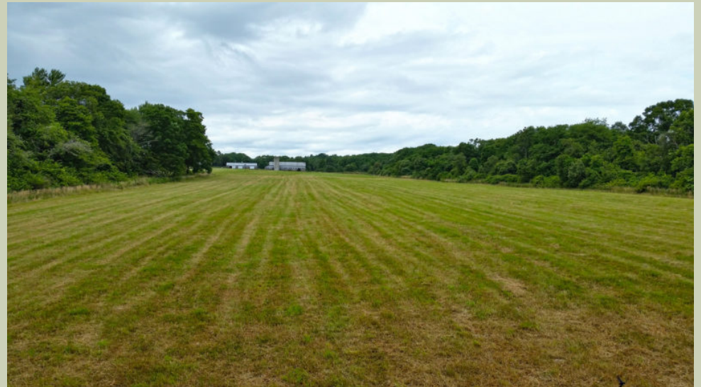
Shaw Cove Fields and Marshes Conservation Project, Buzzards Bay Coalition