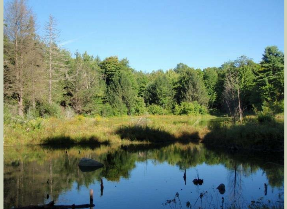
Leyden Working Farms and Forest, Franklin Land Trust