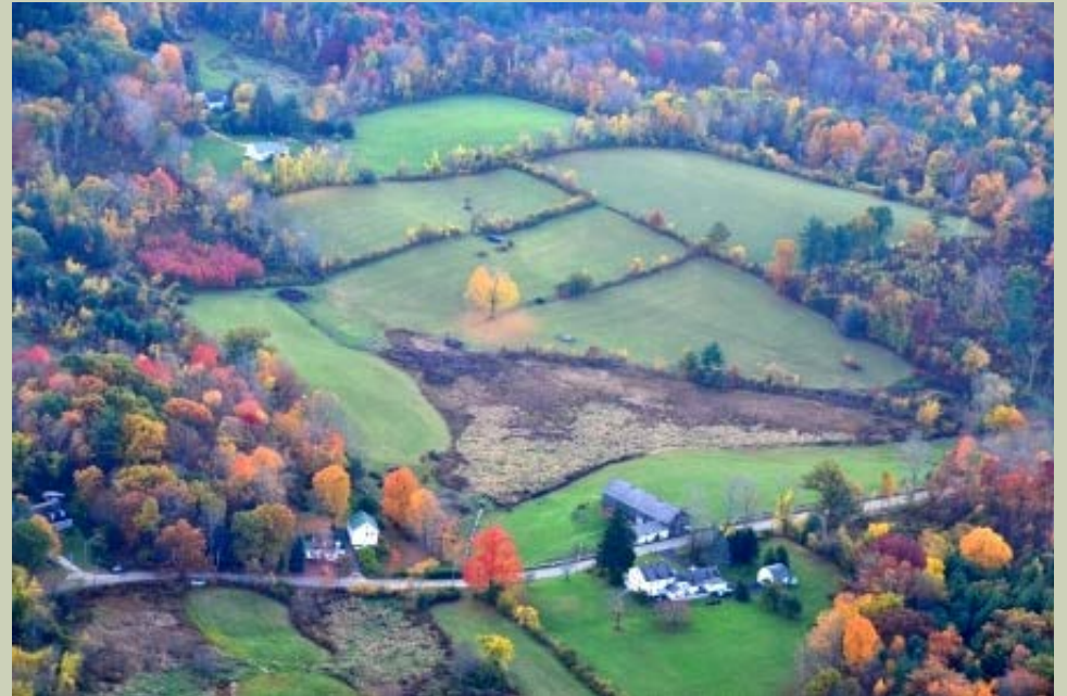
Wendemuth Meadow, North Brookfield