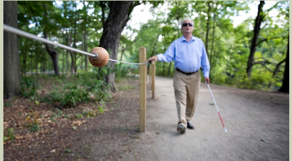
Watertown Riverfront Park Braille Trail