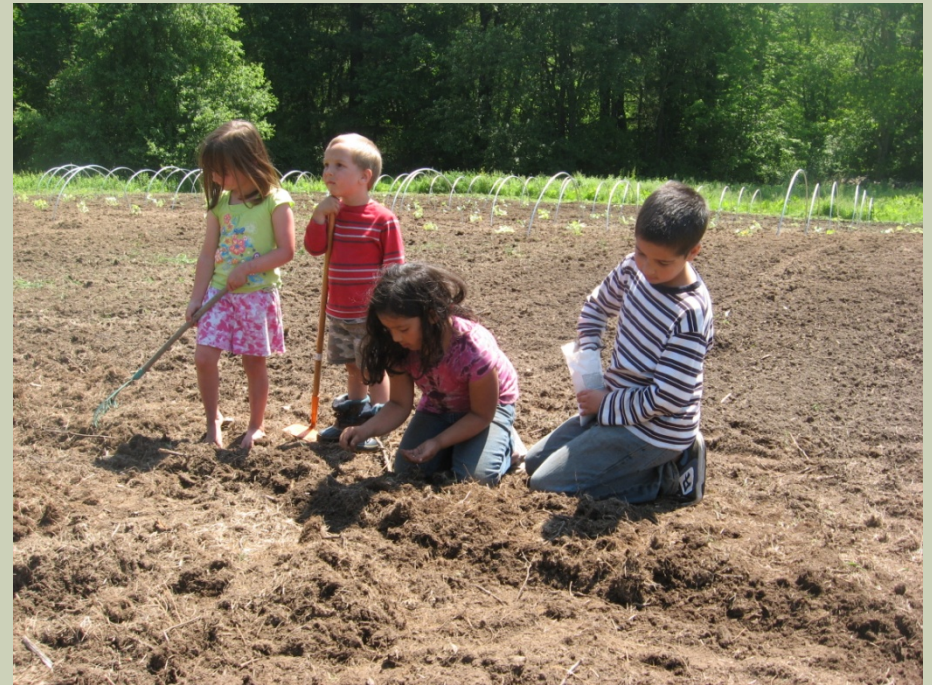
Frohloff Farm, Ware