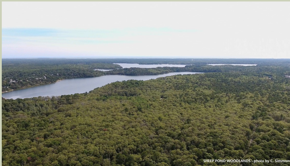
Gulls Way Forest, Brewster Conservation Trust