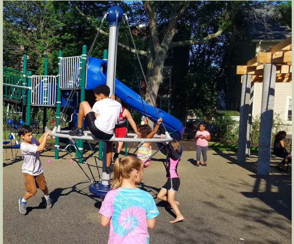
Mary Jane Lee Park, Salem