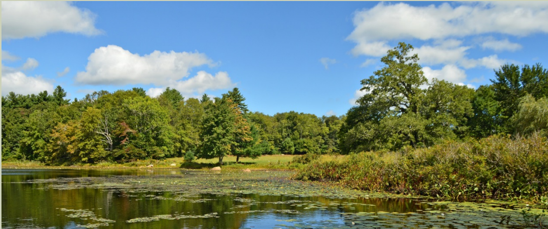
Mattapoissett River Aquifer Protection project