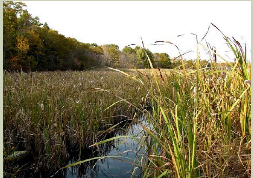
Sibley Farm, Spencer Mass Audubon, Common Ground Land Trust, and the Greater Worcester Land Trust