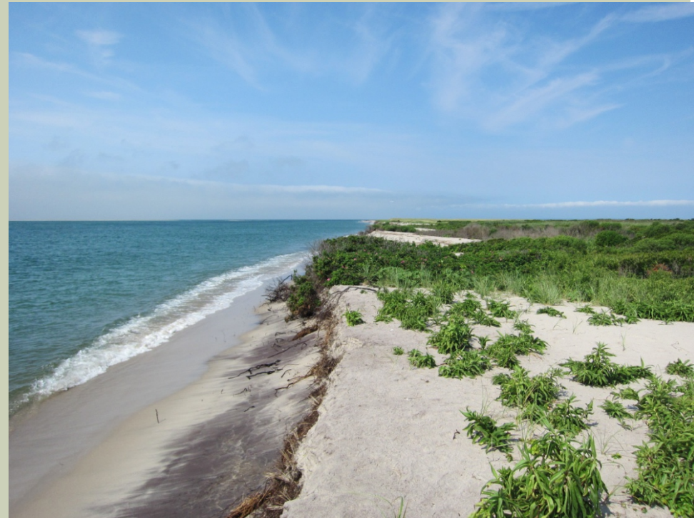
Muskeget Island, Nantucket Land Council