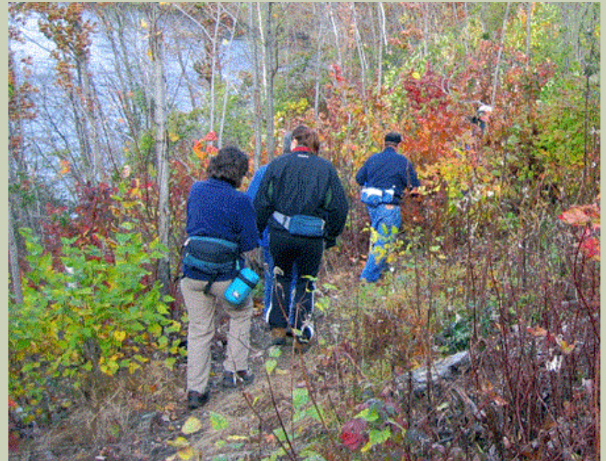
Andover Village Improvement Society, Franciscan Acquisition