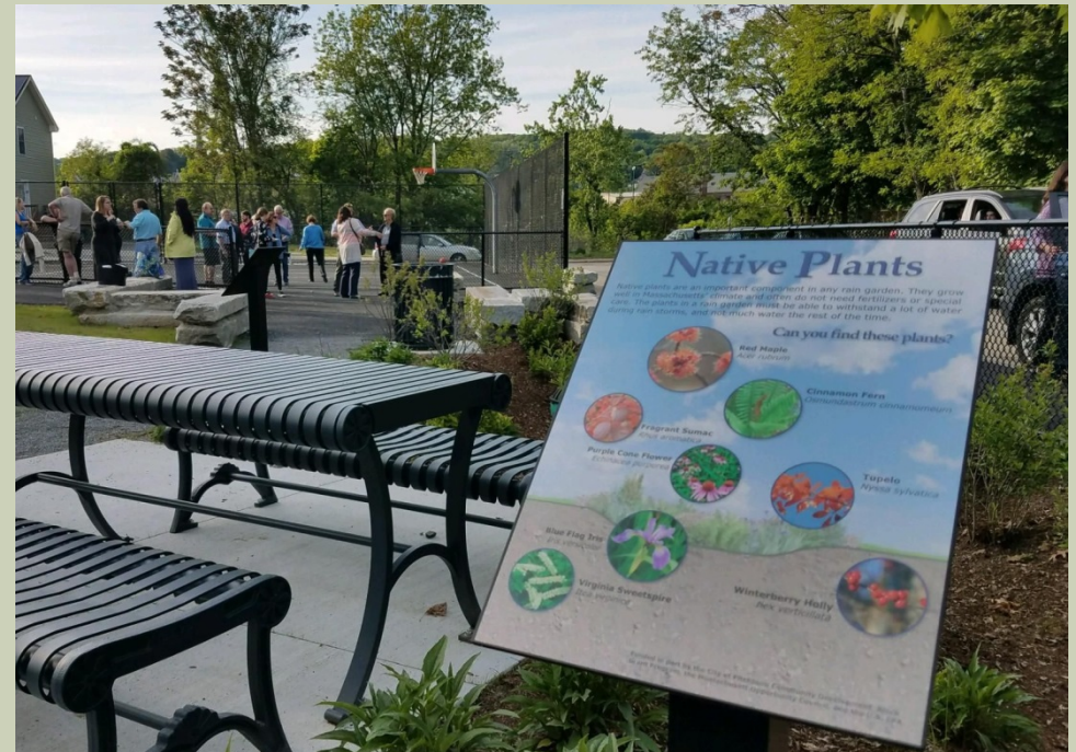
First and Railroad Street Park, Fitchburg