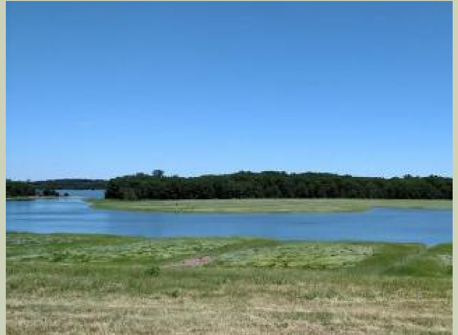
Back River Trail, Weymouth